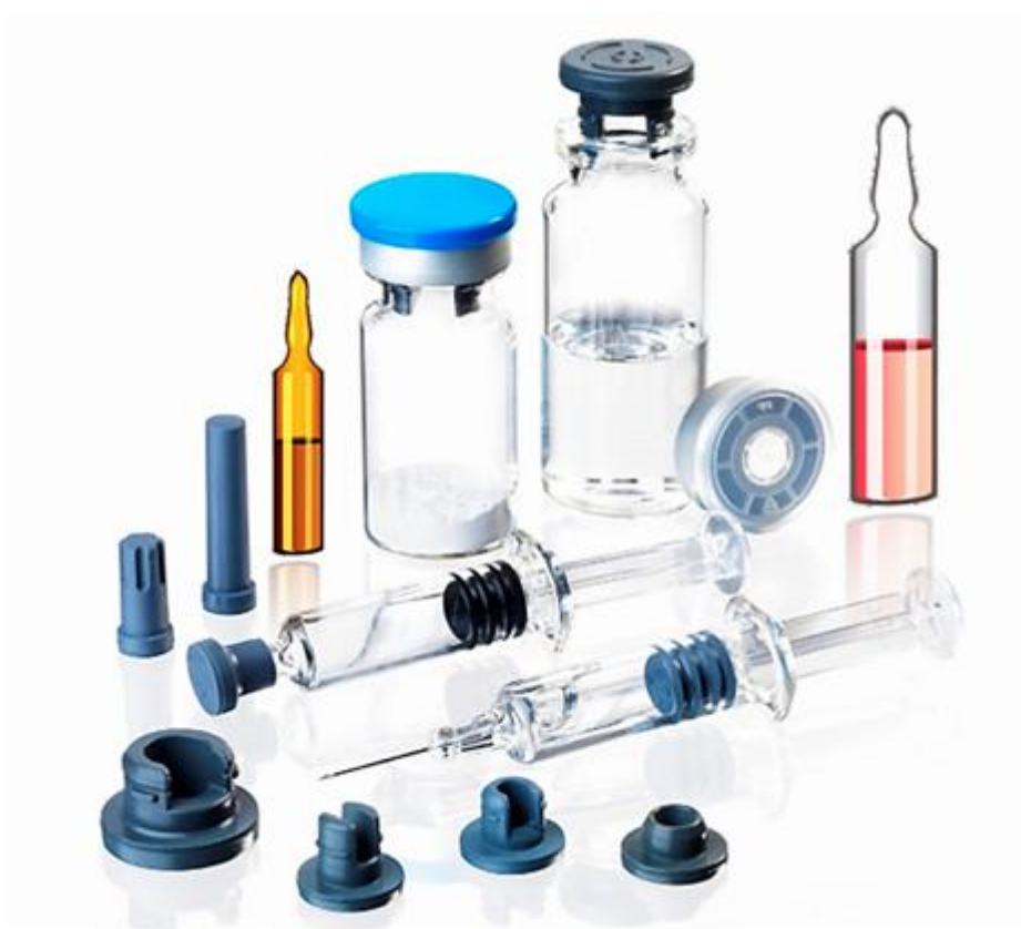
Fig.1 Liquid dosage forms.

Liquid dosage forms is pourable pharmaceutical preparations, it is also one of the oldest dosage form used in the treatment of patients and affords rapid and high absorption of medicinal products. Liquid dosage form contains a mixture of active pharmaceutical ingredients and non-pharmaceutical ingredients (excipients) dissolved or suspended in a suitable solvent or mixtures of solvents. They are administered by oral and parenteral (injection, inhalation, ophthalmology, ear canal, nasal cavity and topical) routes. Oral liquids are non-sterile, while liquids administered by parenteral routes are available in sterile and non-sterile formulations.