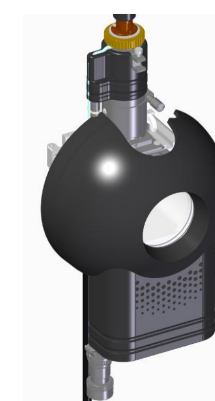
Technical drawing of the VIP-HESI source

For the evaluation a dilutions series of SPLASH mix was prepared without matrix in methanol and with matrix in SRM1950 (30 µL SRM1950 plasma extract equivalent in 1 mL Methanol) shows the results for negative.