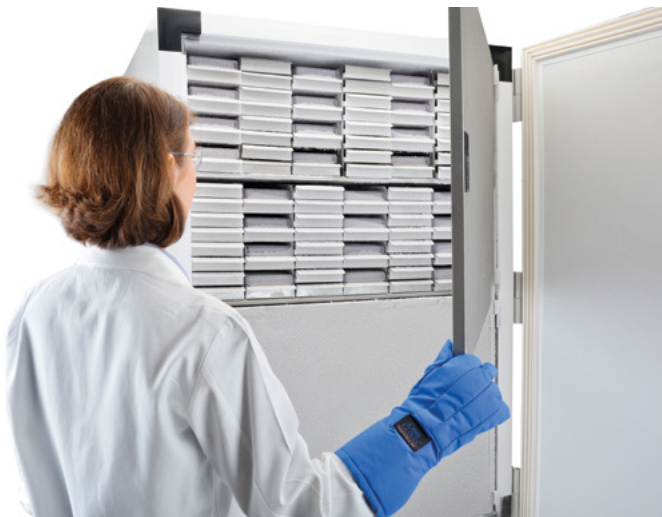
Figure 2. Adaptive control of cooling. The V-drive technology featured in TSX Series freezers is designed to detect conditions such as multiple door openings and adjust to a higher compressor speed when required.

Our commitment to environmental responsibility doesn't end there. Our freezers and refrigerators are manufactured in a facility that has achieved zero waste to landfill, meaning that more than 90% of the waste generated at our manufacturing site is diverted from landfill. Finally, the TSX Universal Series ULT freezers operate at 43.6–49.8 dB, a noise level similar to that of a library [3]; this allows them to be located conveniently inside the lab.