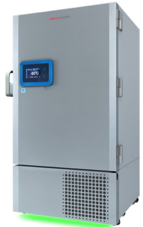
Figure 1. TSX Universal Series ULT freezer. Available in four sizes, the smallest unit, the TSX40086, shown here, can hold up to 400 boxes in a 8.21 sq. ft. footprint, while the largest unit, the TSX70086 freezer, can hold up to 700 boxes in an 14.26 sq. ft. footprint.

The TSX Universal Series ULT freezers (Figure 1) feature our next-generation Universal V-drive adaptive control technology, designed to minimize energy consumption without sacrificing sample security. While conventional ULT freezers use single-speed compressors that continually cycle on and off, the V-drive runs the compressors at variable speeds, adjusting cooling performance to the cooling demands inside and outside the freezer. When conditions are stable, the V-drive controls the system at low speed, which helps reduce energy consumption while maintaining a stable temperature for sample protection. When there are frequent door openings or samples being added to the freezer, the system detects the activity and increases the drive speed (Figure 2).