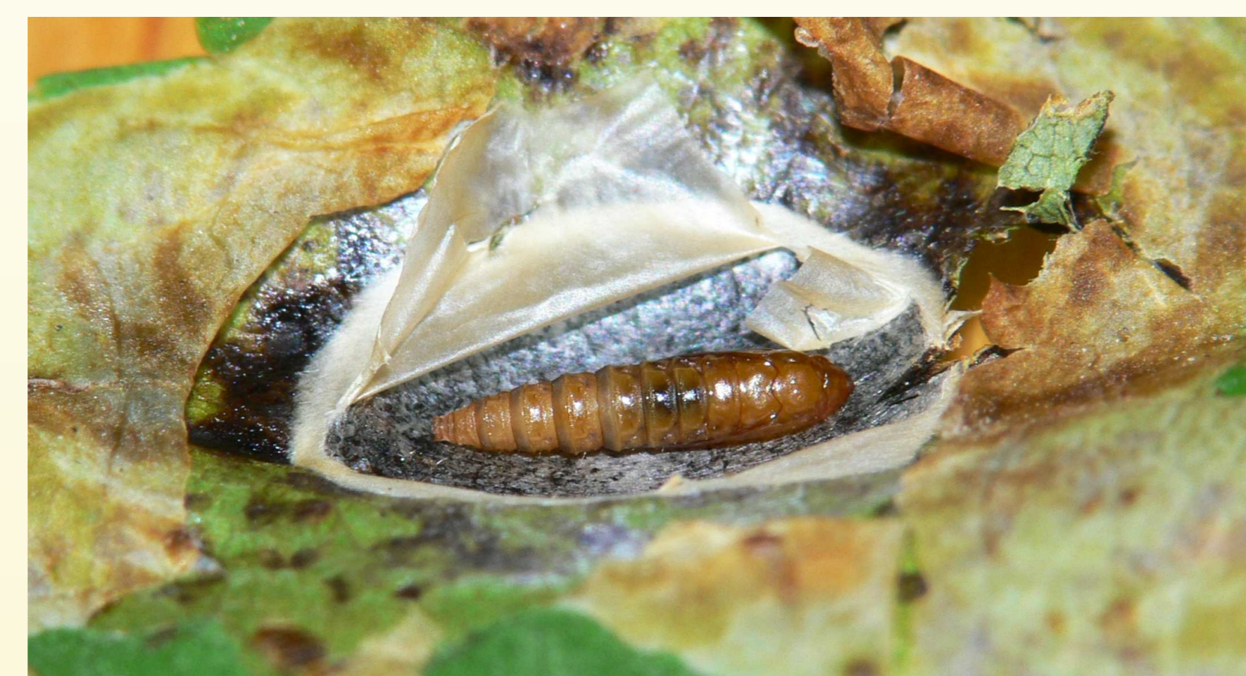
FIGURE 3: Diapausing pupa of C. ohridella in a chamber.

The leaves were dissected and the pupae (Fig. 3) were individually kept at room temperature and high humidity conditions suitable for development of mycosis. The strains of the fungus were isolated from individual infected pupae using growth medium (Sabourau's agar) and are deposited in CCEFO (Culture Collection of Entomopathogenic Fungi Olešná) in the Czech Republic.