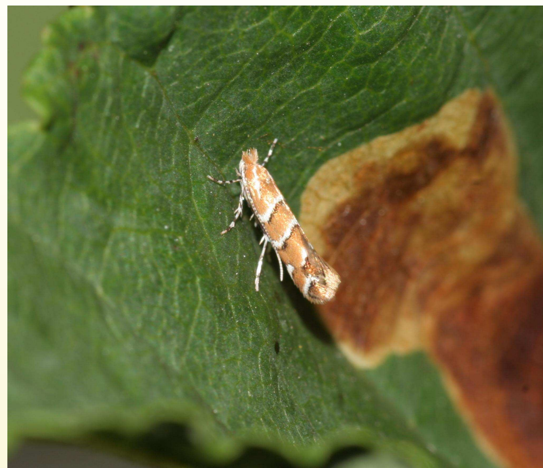
FIGURE 2: Adult of the horse chestnut leaf-miner, C. ohridella .

Since its first record in Macedonia in 1985 it rapidly spread and colonized major parts of Europe including Denmark, south of Sweden, Belorussia and Ukraine. The pest encounters favourable conditions for its development also in the Czech Republic because of a limited spectrum of natural enemies.