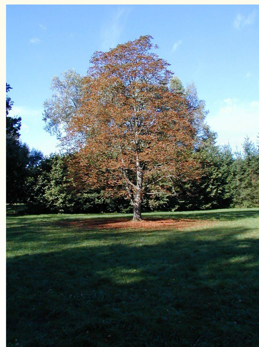
FIGURE 1: A horse chestnut tree in a city park.

The horse chestnut, Aesculus hippocastanum L. (Fig. 1), is an important ornamental tree in Europe. It is attacked by the horse chestnut leaf-miner, Cameraria ohridella Deschka et Dimic (Fig. 2), an important invasive lepidopteran pest.