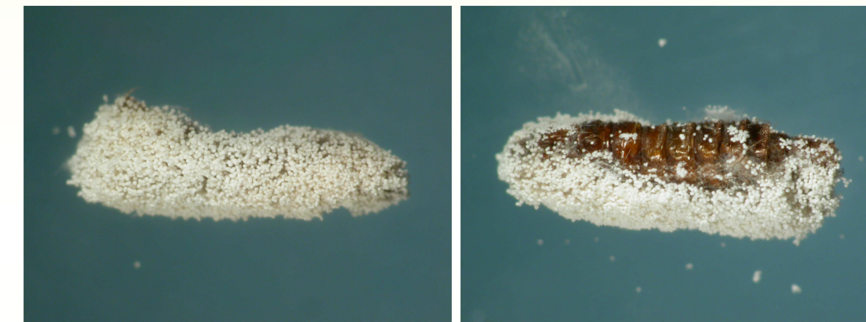
FIGURE 4: Hibernating pupae of C. ohridella infected by B. bassiana .

Development of mycosis was observed on numerous diapausing pupae. Most of the pupae were infected by saprophytic fungi, only few were covered by mycelia with conidiophores and conidia of Beauveria bassiana (Bals.) Vuill. (Fig. 4–6).