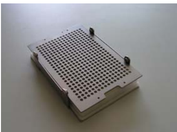
Fig. 3: completed reaction module

The reaction module consists of a rack, the microplate, the perforated plate and a separate sealing mat. The locked 384 „reactors“ are supplied to the HPMR 50-384 with the reagents and agitating stir discs under inert conditions.