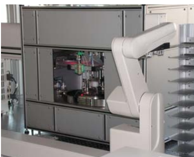
Fig. 1: HPMR 50-384 in laboratory

The developed reactor enables the simultaneous execution of 384 reactions in a reaction module under reaction pressures and temperatures of 50 bar and 100°C . The mixing of the reagents used is realized with magnetically propelled stir discs with a velocity up to 500 rpm .